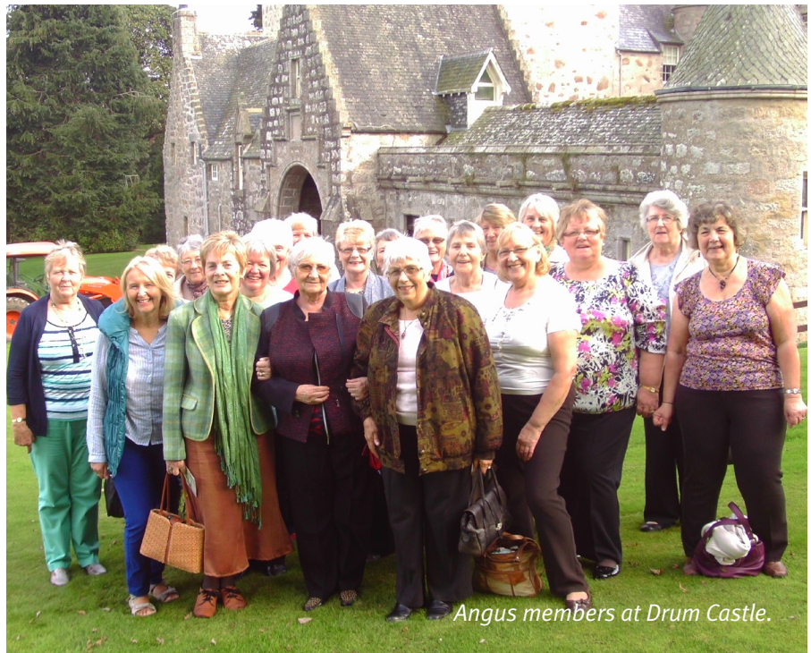
Angus members at Drum Castle.

ANGUS BRANCH had an outing to Drum Castle in September. The Castle takes in an enormous sweep of Scottish history as experienced by the Irvine family who lived in Drum Castle for over 650 years, from the 14th century onwards. Drum is one of Royal Deeside's top historic attractions, just 10 miles from Aberdeen. It is one of Scotland's oldest tower houses and is set beside ancient oak woodland and a walled garden that contains a fine collection of historic roses. William de Irwyn was gifted the Royal Forest of Drum and the Tower of Drum by King Robert the Bruce in 1323. The tower has benefitted from various improvements over the centuries, including a Jacobean mansion house extension in 1619 and Victorian adaptations, such as the impressive library converted from the lower hall.