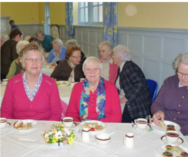
Mingling and munching