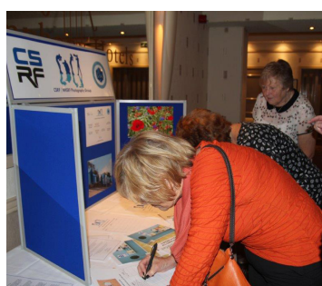
Signing up for the Book Club.