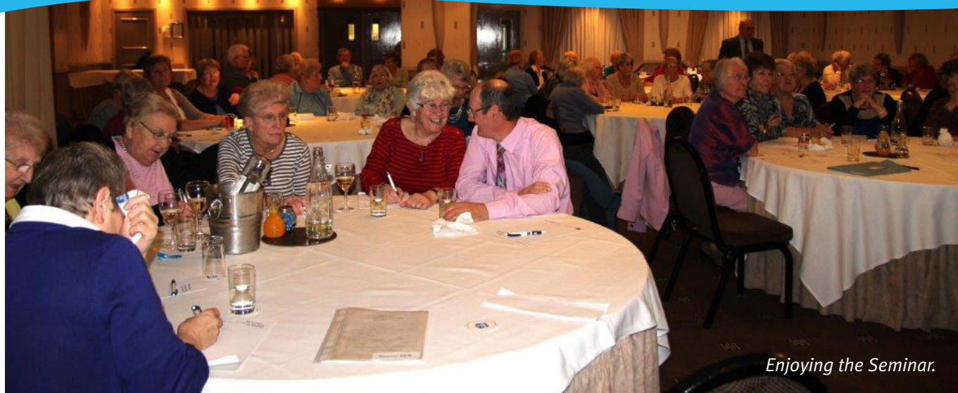
Enjoying the Seminar.